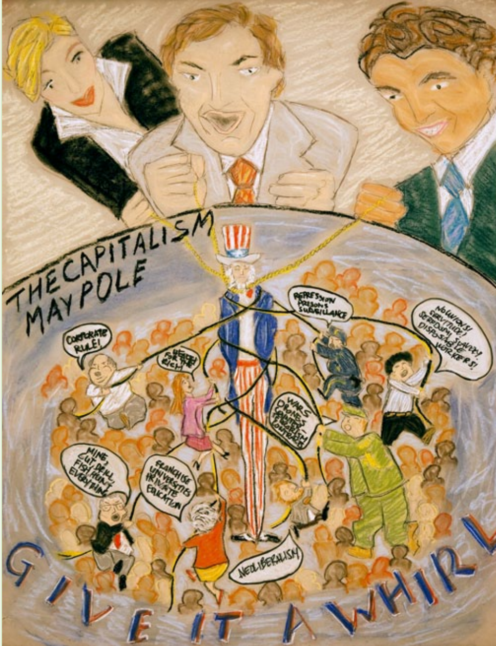
Illustration by Sandra Nurse

capital. Since the Reagan-Bush era the barriers between national capital—in our case federal regulations—and this play of global capital have been slowly relaxed, until, the collapsing of investment banks and commercial banks in 1999 effectively removed conflict of interest prohibitions between investment bankers serving as officers of commercial banks, took control away from government controlled enterprise, and gave it over to global capital flows. It is because of the demand that capital flow in and out as fast as possible that, even when human beings were suffering and being beaten down into the 99%, as a result of the housing crisis, banks had to be “bailed out” so that