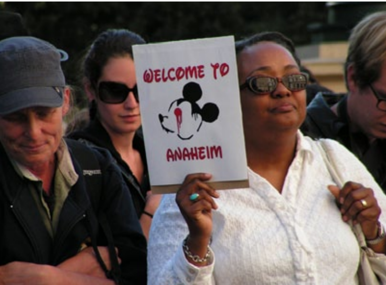
Community protest against police violence, Anaheim, CA, July 2012