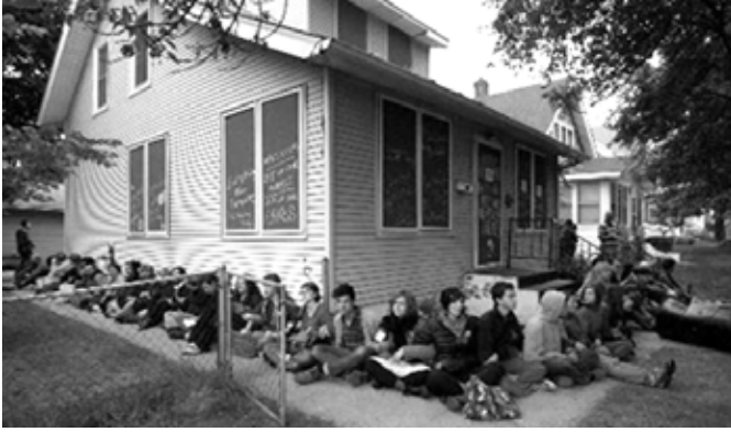
Eviction defence, Occupy Minneapolis, 2012

DEBT IS THE TIE THAT BINDS THE 99%. We must transform our failed economic system that impoverishes millions while destroying the ecosystem. Using a diversity of tactics that includes a Rolling Jubilee, a People's Bailout, and vigorous organizing towards a debt strike, Strike Debt seeks to abolish debt as it currently exists and reconstruct a just society where our debts and bonds are to one another and not the 1%. The 99% are forced into debt to pay for basic social needs like education, housing, and healthcare while the 1% profits. We can no longer afford our own oppression. We are citizens, homeowners, renters, teachers, students, parents, children, debtors, and defaulters who don't owe the banks anything. We owe each other everything.