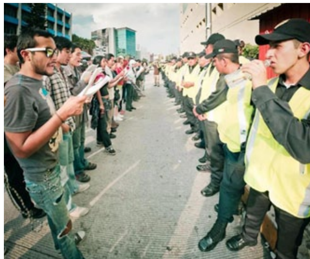
Top: In Mexico, student movement #YoSoy132 reading poetry to policemen in the 24-hours occupation of Mexican broadcaster Televisa.