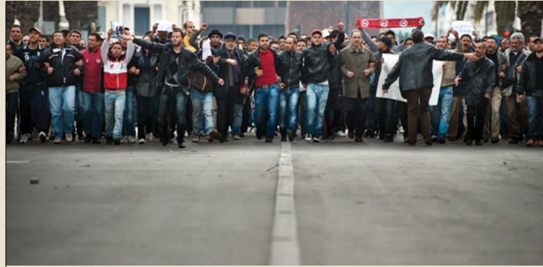
Tunisian Revolution, 2011

doubled the price of water for people’s homes. Early in 2000, the people of Cochabamba rebelled, shutting down the city with general strikes and blockades. The government declared a state of siege and a young protester was shot and killed. Word spread worldwide from the remote Bolivian highlands via the Internet. Hundreds of e-mail messages poured into Bechtel from all over the world demanding that it leave Cochabamba. In the midst of local and global protests, the Bolivian government, which had said that Bechtel must not leave, suddenly reversed itself and signed an accord that included every demand of the protestors. There is little doubt that it did so out of fears of social unrest.