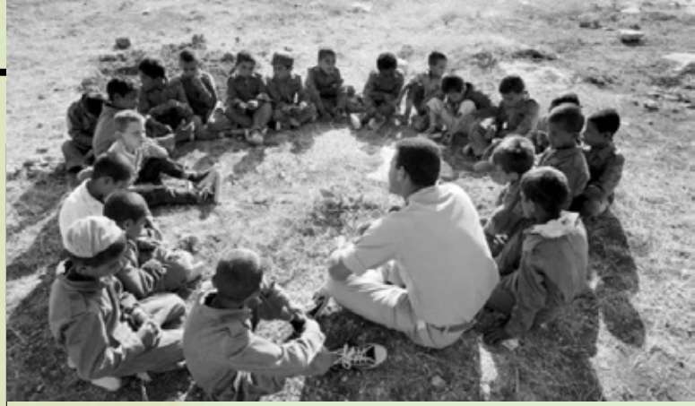
Ghassan Kanafani, a Palestinian writer and activist, in a teaching circle with children in the hills of Lebanon, early 1970s.

Another slogan to watch out for is “giving back.” As the volume of turnover decreases, so called diasporic investment across borders, especially in the country of origin, can raise the amount greatly. This activity can take the form of foreign direct investment being ideologically justified through culturalism and heritagism. In the name of globalizing education, there is now also a trend toward foreign direct investment in for-profit education that can be justified by these unexamined slogans.