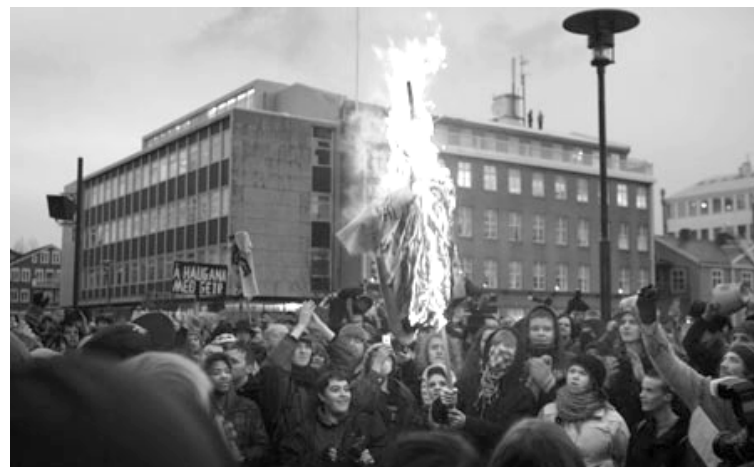
People in Iceland reject debt servitude, 2011

The two are obviously linked. To get a sense of what the most conservative option would be like, one might consult a recent report of the Boston Consulting Group, a mainstream economic think tank. They begin by agreeing that since there’s no way to grow or inflate our way out of debt, cancellation is inevitable. Why postpone it? However, their solution is to frame the whole thing as a one-time tax on wealth to pay off, say, 60% of all outstanding debt, and then declare that the price for such sacrifices by the rich will be even more austerity for everybody else. Others suggest having the government print money, buying mortgages, and giving them to homeowners.