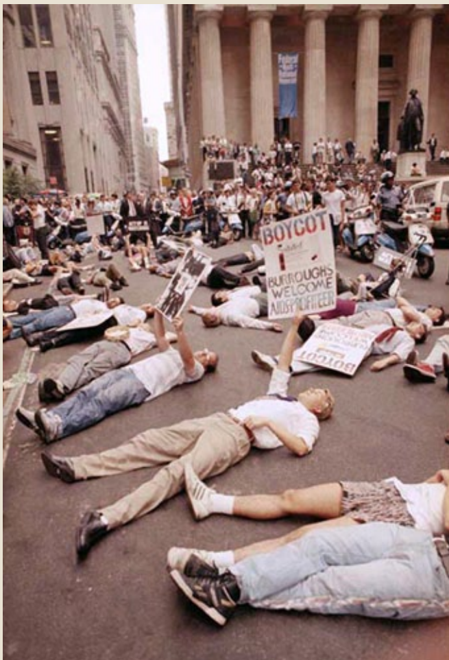
ACT-UP die-in at New York Stock Exchange, 1989

In addition to such targeted threats, the withdrawal of cooperation may generate fear of a more general social breakdown, what is often characterized as “social unrest.” For example, in the late 1990s, under heavy pressure from the World Bank, the Bolivian government sold off the public water system of its third largest city, Cochabamba, to a subsidiary of the San Francisco-based Bechtel Corporation, which promptly