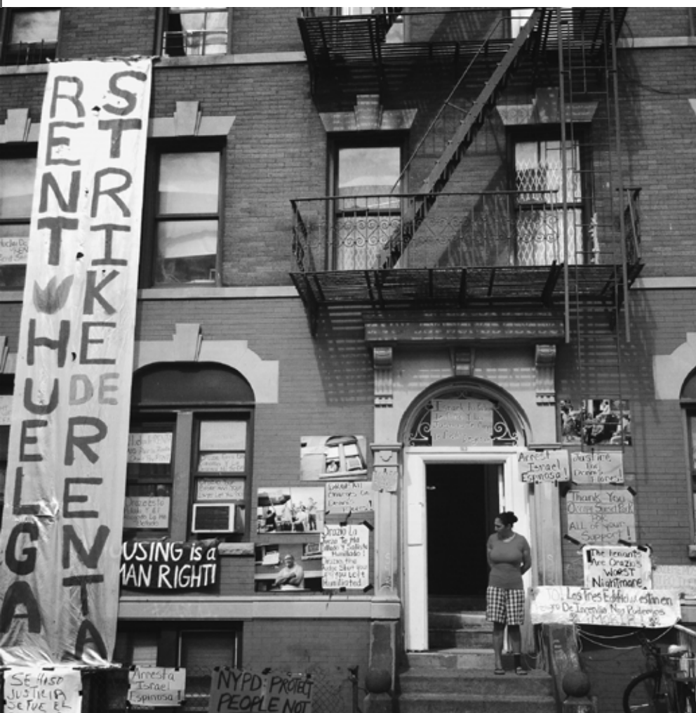
Rent Strike, Sunset Park, Brooklyn 2012.

It's time to take action. Join the resistance. ■