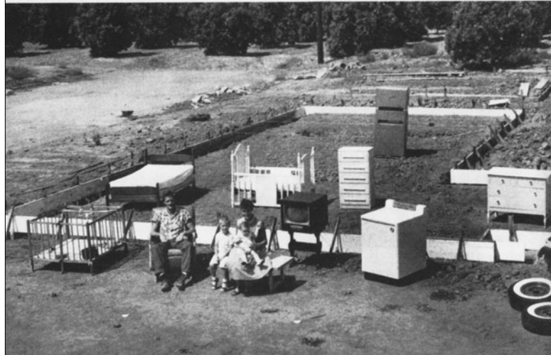
Top: "What They Have"