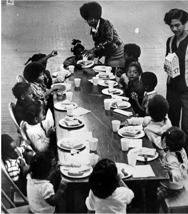
Black Panthers free breakfast program, Oakland, CA, 1969

would mean opening your heart and your imagination; but it would also require committing treason against your own class. It will not be easy or comfortable, but it does promise a better world for our children. ▪