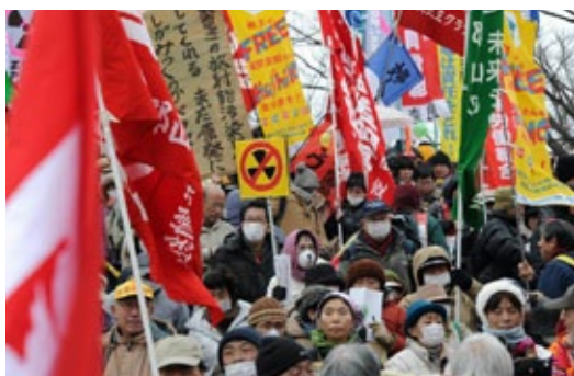
Right (from top): Anti-nuke rally, Tokyo, 2012; May Day, Oakland, 2012; Occupy Central Hong Kong's HSBC tent city, 2012