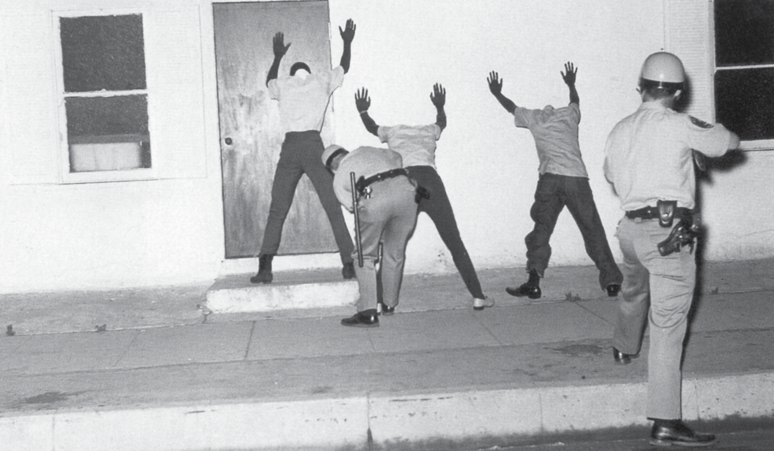
Top: Long Beach, CA, 1965 Right: Brooklyn, NY, 2012

color, and they are likely to look at you cockeyed when you suggest that they even have any rights a police officer or the prison system would ever respect.